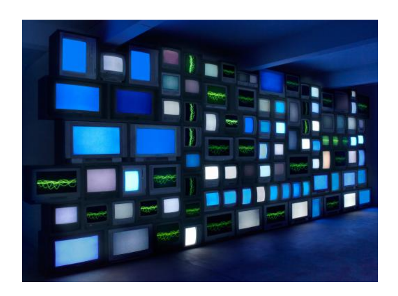
Swedenborg Film Festival 2018 | with Susan Hiller