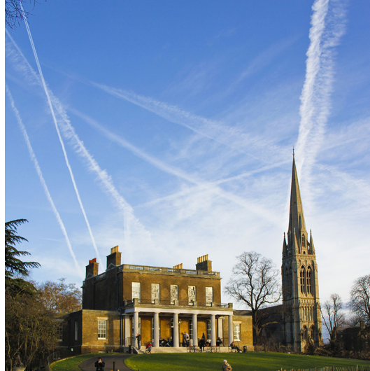
Clissold House